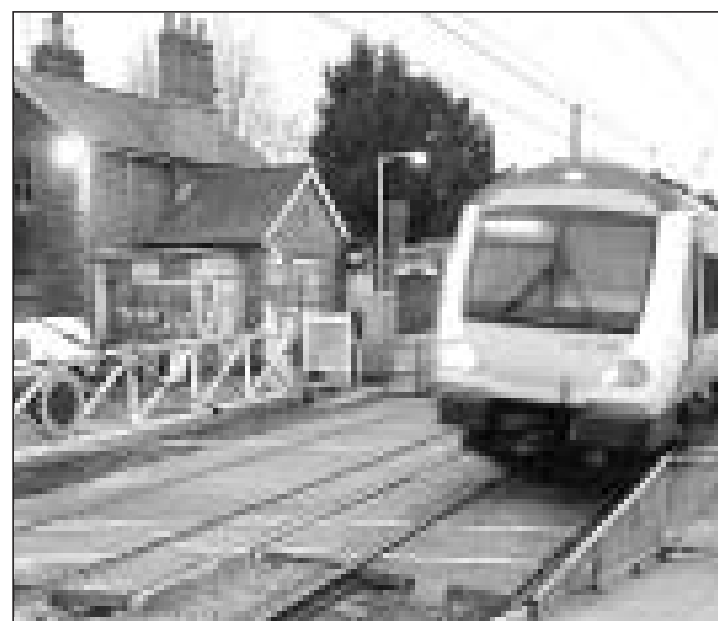
DEATH SCENE: A train on the crossing where the friends died

And a spokesman for Network Rail said the level crossing was closed to vehicles when the accident happened.